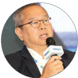
Eddy Wardoyo Consul General of the Republic of Indonesia in Mumbai

S outh Africa, a leading country of the African continent, offers a flourishing market for Indian companies. Our infrastructure, banking, and the thriving presence of MNCs position us as an ideal partner for economic ventures. There is ample room to grow bilateral trade, which will not only fuel economic progress but also strengthen our bonds. With lucrative and secure opportunities, especially in sectors like agriculture, I look forward to expanding our trade relationships.