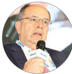
H.E. Javier Paulinich

H.E. Javier Paulinich presented Peru as a stable, resource-rich economy with burgeoning opportunities for Indian businesses in mining, pharmaceuticals, and digital payment systems.