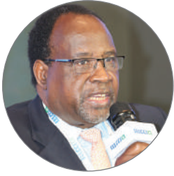
H.E. Percy Chanda High Commissioner of Zambia

H.E. Percy Chanda highlighted Zambia's wealth of natural resources, favorable business regulations, and the safety and opportunities for investment, particularly in agriculture, tourism, and electric vehicles.